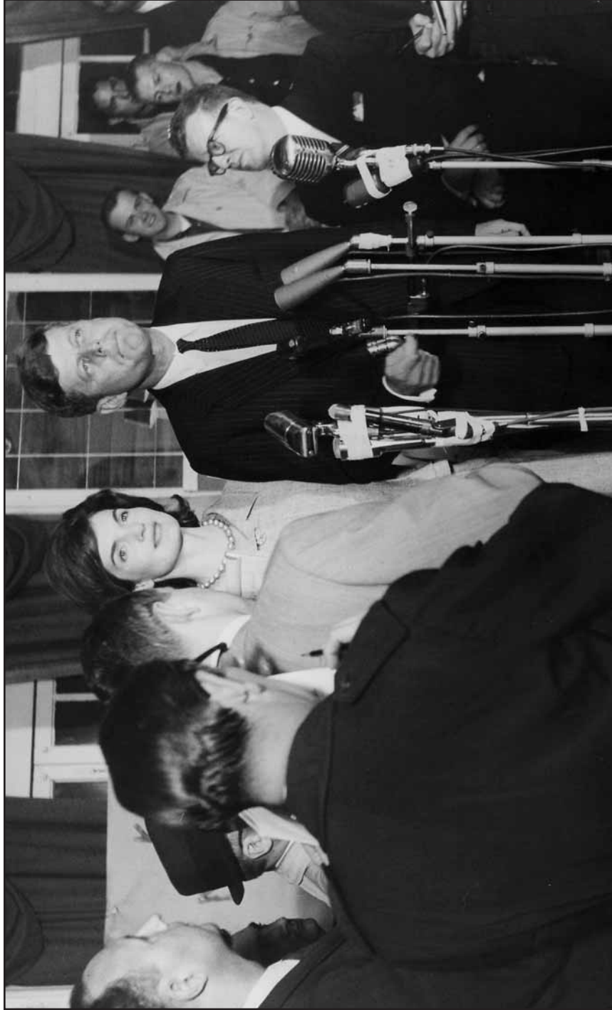
JFK speaks to supporters at the Kanawha Hotel following his resounding victory in the May 10, 1960, West Virginia Primary. Kennedy told the crowd, "I am in debt to the people of West Virginia. I believe now that you have made it possible for me to be nominated for President."