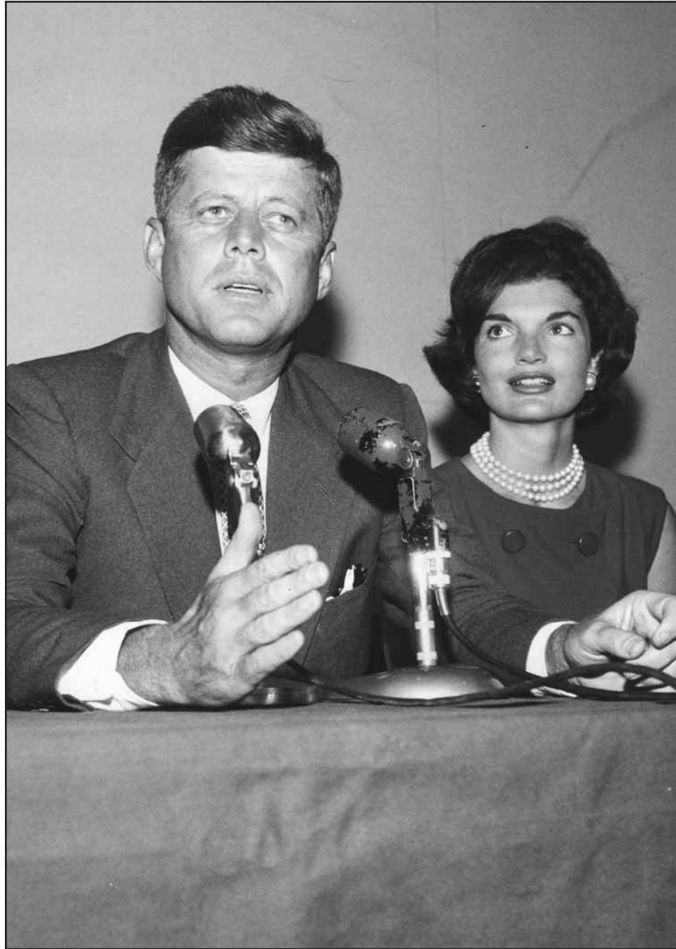
JFK and Jackie campaigning in Charleston.