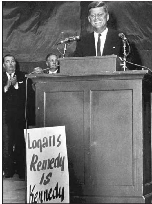
JFK campaigning in Logan County, West Virginia. Far left, U.S. Senator Jennings Randolph, center, State Democratic Chairman, later Governor, Hulett C. Smith.