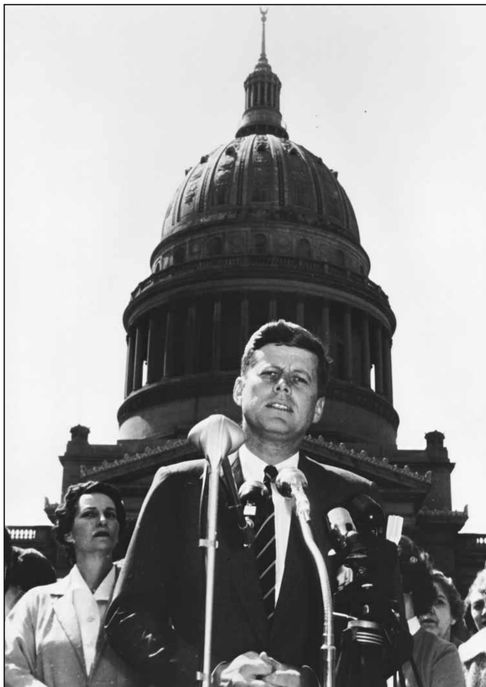
John F. Kennedy campaigning in 1960 in front of the State Capitol in Charleston, West Virginia.