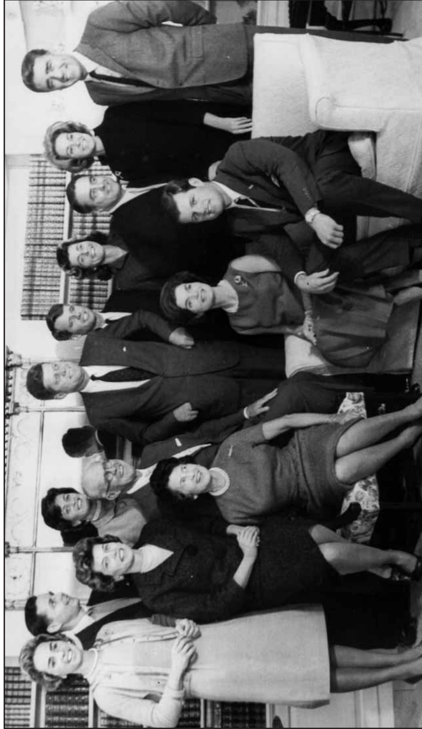
Kennedy family portrait, November 9, 1960—Standing from left, are, Robert Kennedy's wife Ethel, Steve Smith and wife Jean Kennedy, then President-elect Kennedy, Robert F. Kennedy, daughter Patricia Lawford, Sargent Shriver, Ted Kennedy's wife Joan, and Peter Lawford. In foreground, from left, are daughter Eunice Shriver, Joseph P. Kennedy with wife Rose seated in front of him, John Kennedy's wife Jackie, and Ted Kennedy.