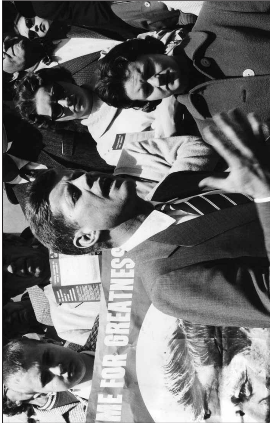
JFK campaigning in Charleston.